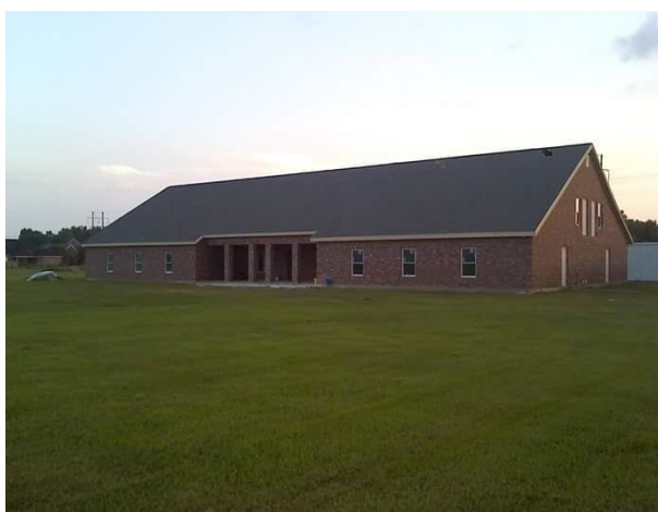
Adullam Household of Faith - Patterson, Louisiana