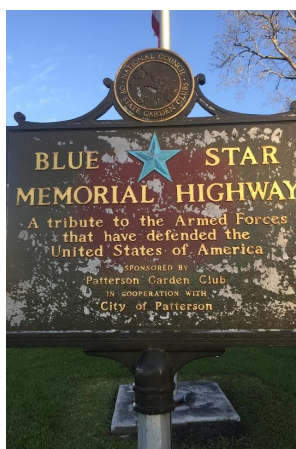
Highway Marker BEFORE

The Patterson Garden Club decided to give Patterson's Memorial Markers a facelift and recently had the two Blue Star Memorial Markers refurbished. The original highway marker (middle and far right photo) was dedicated by the PGC and the City of Patterson in 1999 at Patterson's entrance on Highway 90. The smaller by-way marker (left photo) was dedicated in 2004 and is located in the front lawn of Patterson City Hall on Main Street.