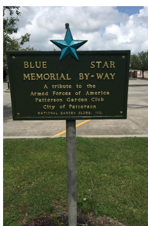
Refurbished By-Way Marker