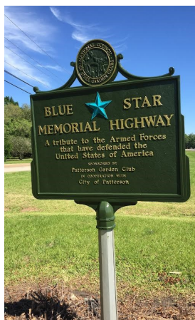
Highway Marker AFTER