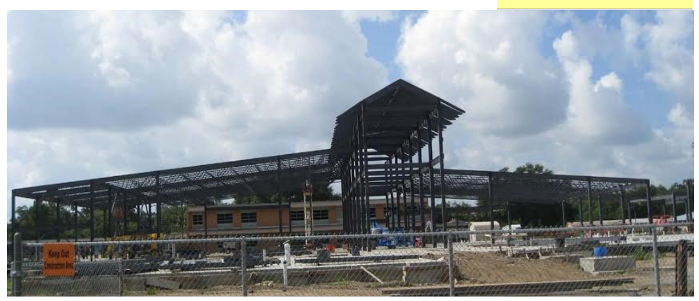
New On-going Patterson Jr. High School Structure—Work In Progress