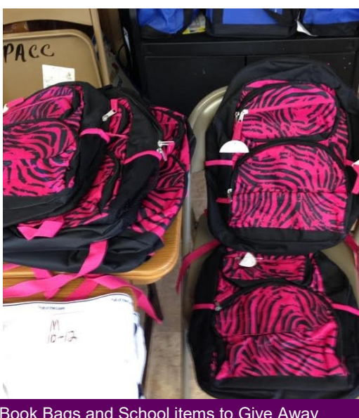
Book Bags and School items to Give Away