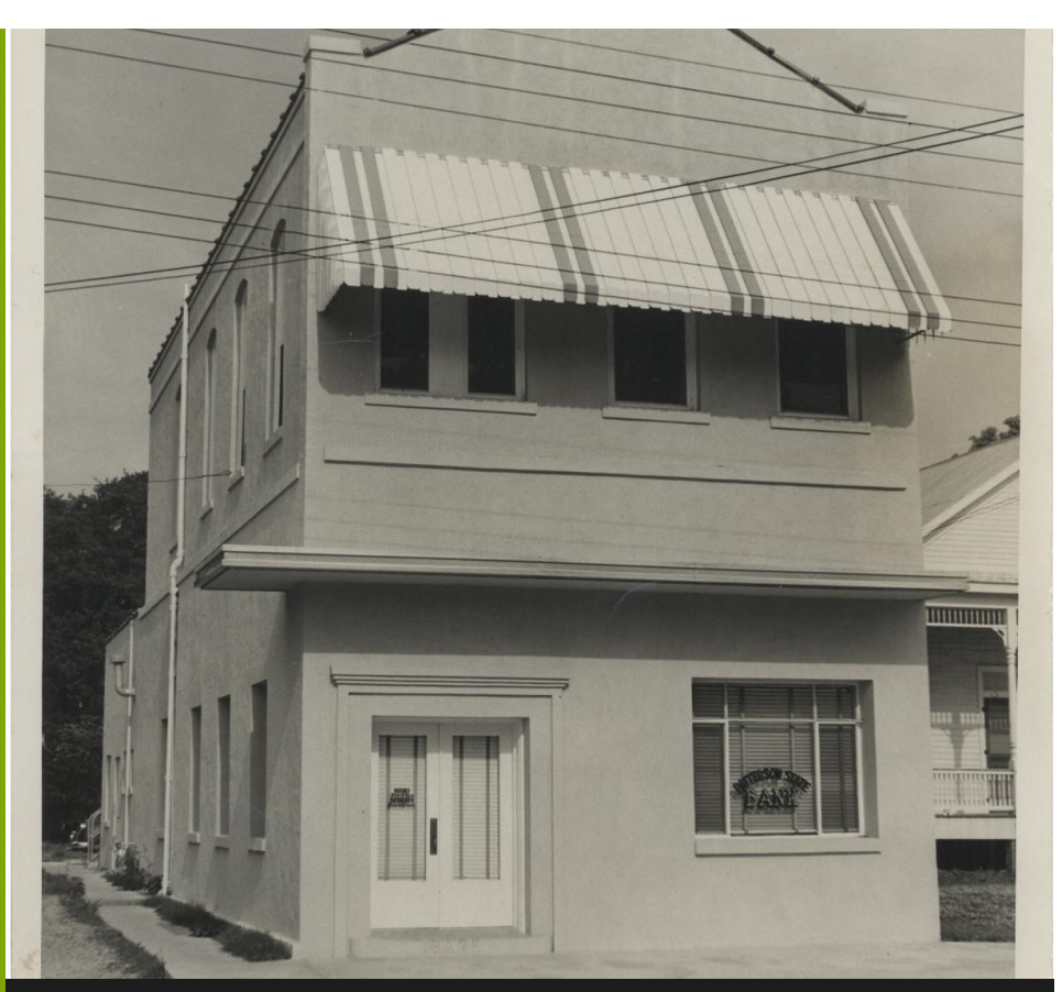
Original Patterson State Bank Building on Main Street