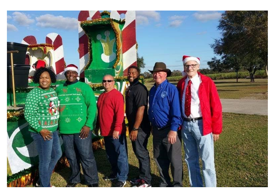
And a Prosperous New Year!