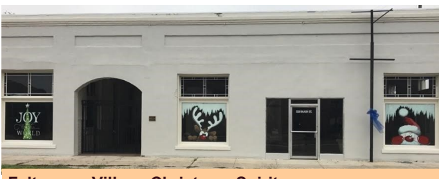
Felterman Village Christmas Spirit