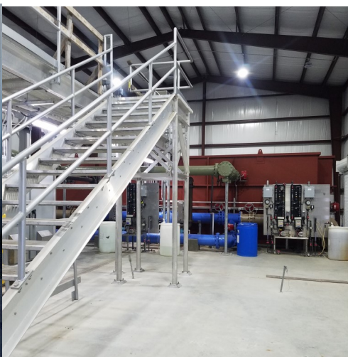
Inside View of New Water Plant

The citizens of Patterson will soon be the proud owners of a new state of the art water plant to replace the current 77 year old one. The $4.5M water system is the first of its kind in the State of Louisiana and is the model for other plants in the State to follow.