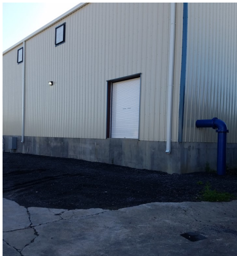
Outside View of New Water Plant