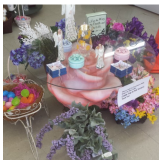
Gift Shop Items