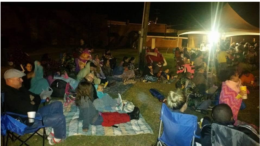
Movie goers enjoy watching a movie under the stars in Morey Park

ALL ISSUES OF THE ATCHAFALAYA CHATS ARE POSTED ON THE WEB