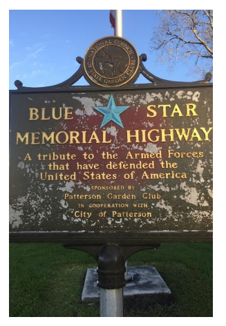
Refurbished By-Way Marker