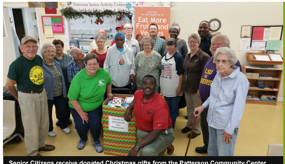
Senior Citizens receive donated Christmas gifts from the Patterson Community Center