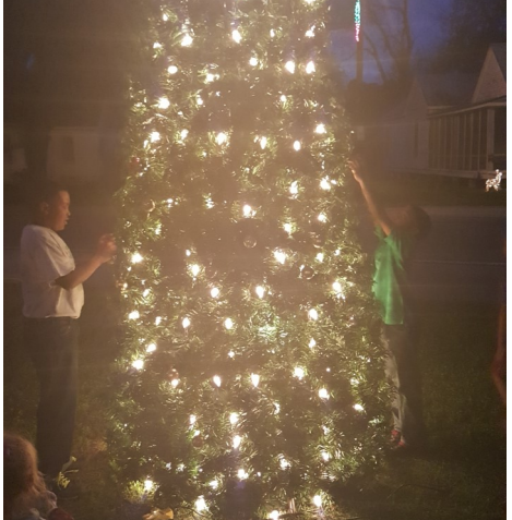
Members of the Make-a-Difference Club add handmade ornaments to City Hall tree