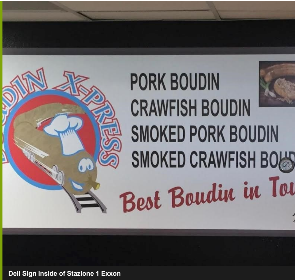
Deli Sign inside of Stazione 1 Exxon

The deli sells smoked boudin in both pork and crawfish. It is also serving rotisserie chicken, a variety of Stazione po-boys, salads, and an assortment of sweets made at it's Pierre Part location.