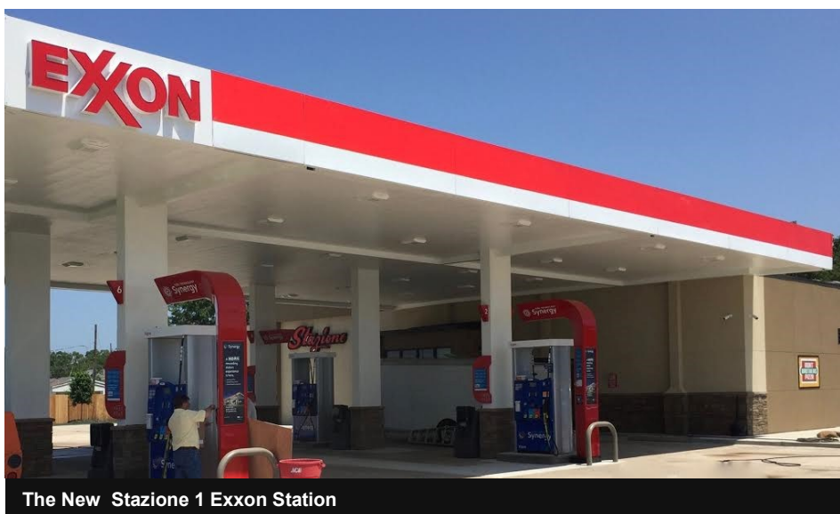
The New Stazione 1 Exxon Station