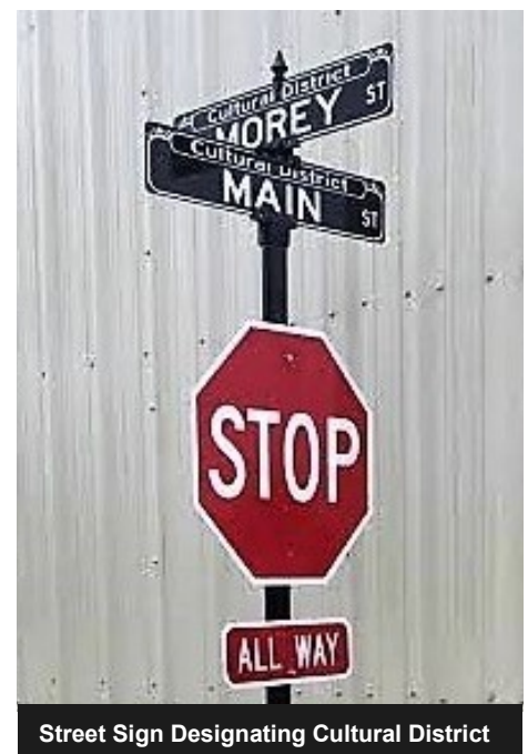
Street Sign Designating Cultural District

The Cultural District consists of Main and First Streets between Railroad and MLK, and all of Catherine Street. It is intended to place emphasis on diverse art forms and artists who wish to showcase and bring attention to their unique crafts. Patterson is rich in cultural diversities.