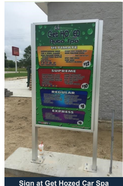
Sign at Get Hozed Car Spa