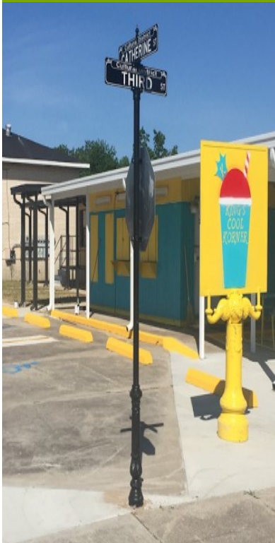
Pictured is King's Cool Korner