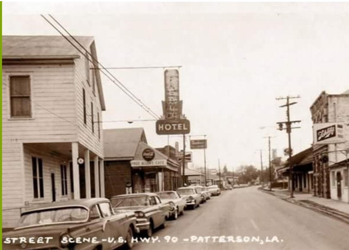
Old Main Street Patterson, Louisiana

ALL ISSUES OF THE ATCHAFALAYA CHATS ARE POSTED ON THE WEB