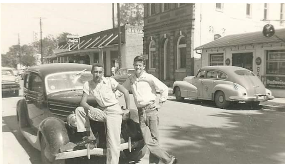
A Retro Scene from Patterson's Main Street. Can you guess who they are?