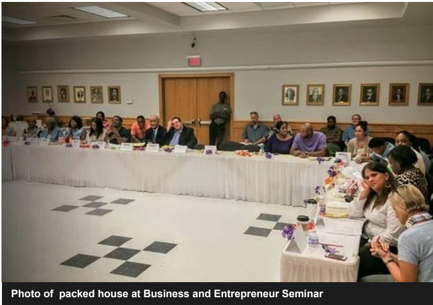
Photo of packed house at Business and Entrepreneur Seminar